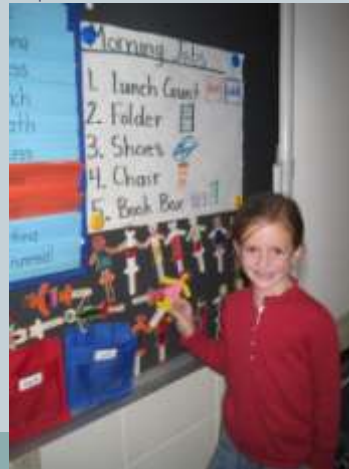
Signing up for hot or cold lunch