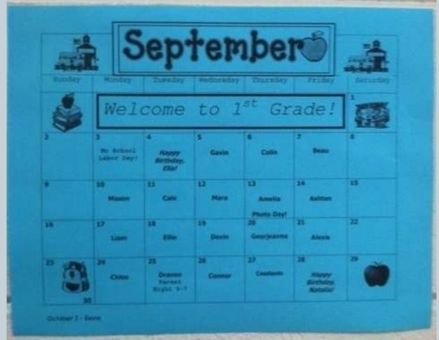
Monthly Snack Calendar