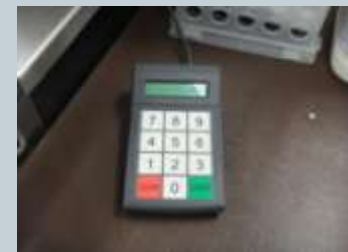
Lunch Code Pad