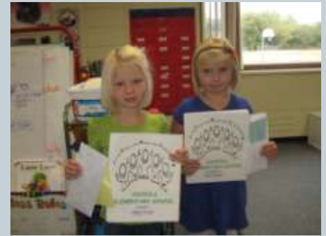
Bringing in our folders and important notes