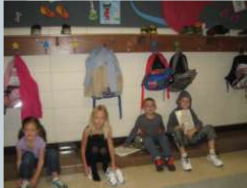
Putting on our inside shoes