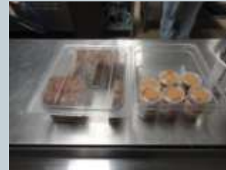
Peanut Butter Sandwich